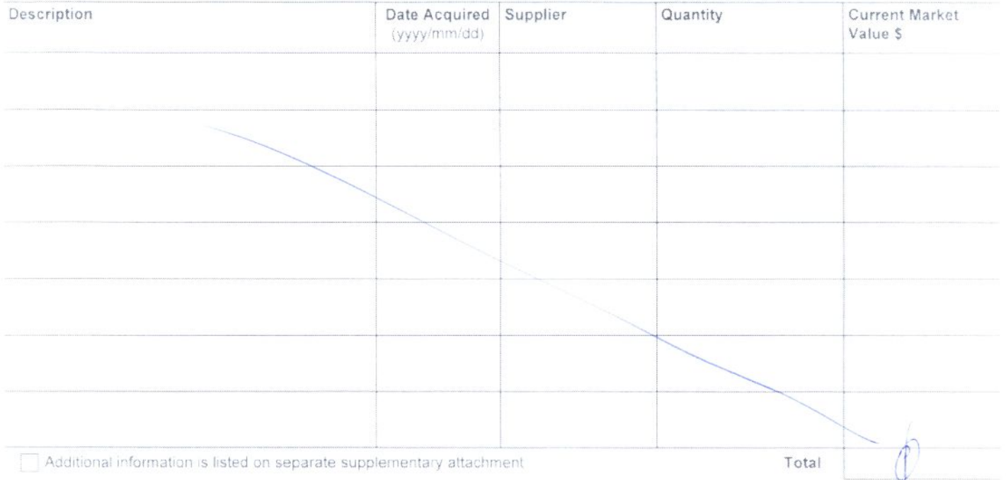
Table 4: Inventory of campaign goods and materials from previous municipal campaign used in this campaign (Note: value must be recorded as a contribution from the candidate and as an expense)